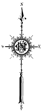
EXHIBIT NO. A D E